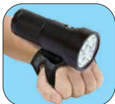
Goodman glove for hands-free operation