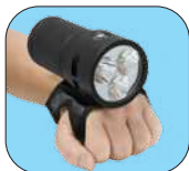
Goodman glove for hands-free operation