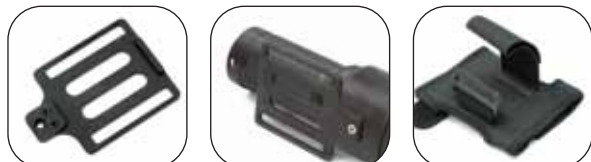
Aluminum Adapter plate