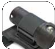
Tighten by pulling the Velcro