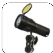
*Photographic Arms and Clips are sold separately