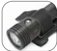
Put the Velcro through the slot of the plate and through the loop