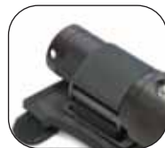
Tighten by pulling the Velcro