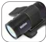
Put the Velcro through the slot of the plate and through the loop