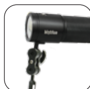
*Photographic Arms and Clips are sold separately