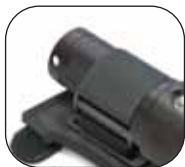
Tighten by pulling the Velcro