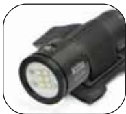
Put the Velcro through the slot of the plate and through the loop