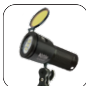
*Photographic Arms and Clips are sold separately