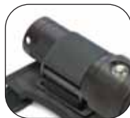
Tighten by pulling the Velcro