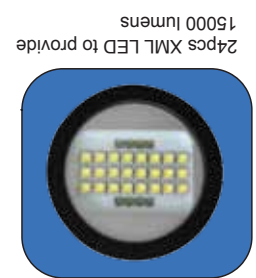
24pcs XML LED to provide 15000 lumens

Tel : (852) 3568 0773 Email : customerservice@bigblue.com.hk Web : www.bigblue.com.hk MADE IN CHINA Patent Pending