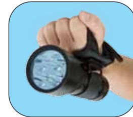
Goodman glove for hands-free operation