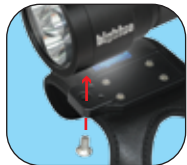
Fix the glove on the light with the supplied screw