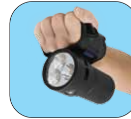
Goodman glove for hands-free operation