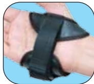
Tighten by pulling the velco