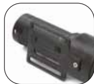
Fix the plate with the supplied screw