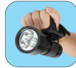
Goodman glove for hands-free operation