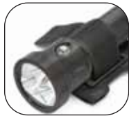
Put the Velcro through the slot of the plate and through the loop