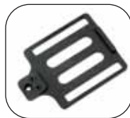
Aluminum Adapter plate