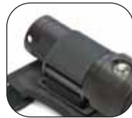
Tighten by pulling the Velcro