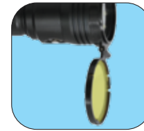
Built in red color led enhances focusing performance