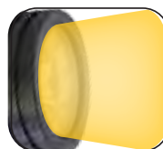
Built-in yellow color led enhances warmer color tone